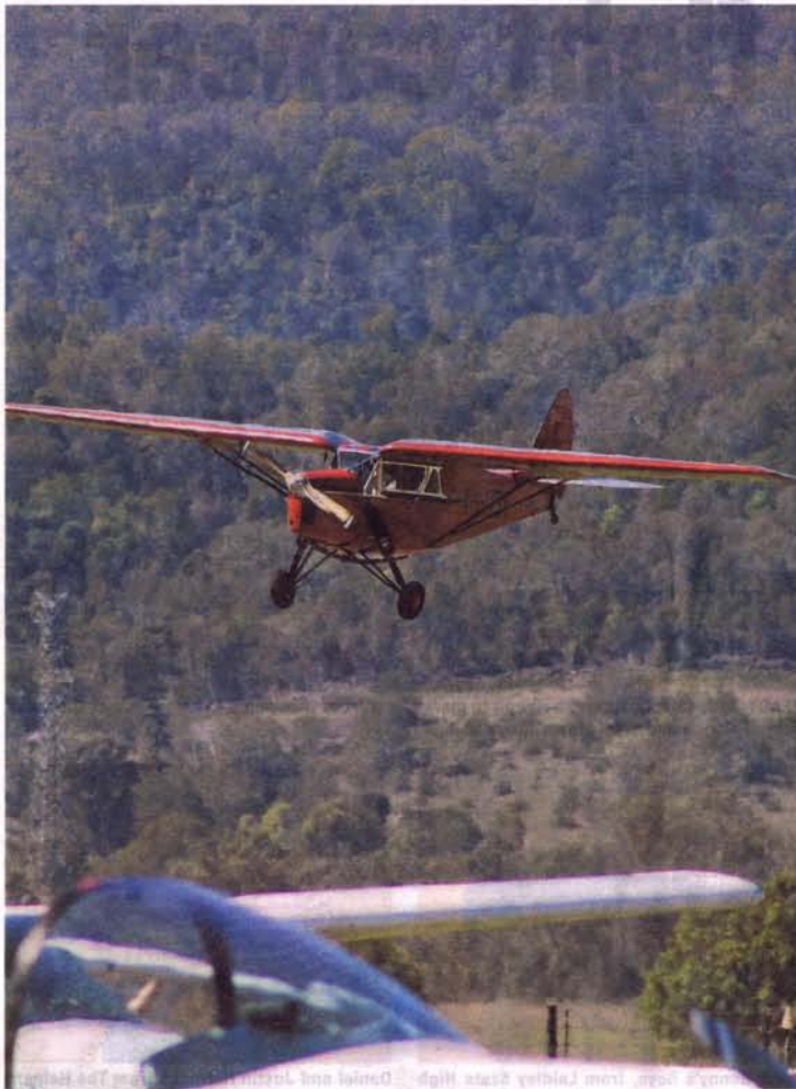
FLY-IN: A wide variety of planes flew in for the Brisbane Valley Airshow.