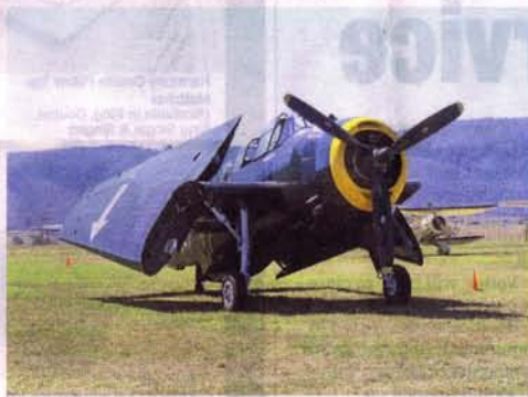
Plenty of planes flew in for the Brisbane Valley Airshow.