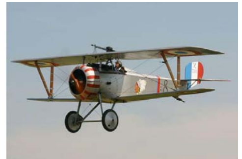
Fokker E111 Eindecker, Morane-Saulnier Model L and Nieuport N17 replicas above.

On the right is Bruce and Mary Clark's Nieuport 12 as seen uncovered at the recent Festival of Flight. Whilst it seems a shame to hide all of Bruce's workmanship of the airframe, covering is continuing prior to applying the paint scheme. This aircraft will be impressive when completed due to its size and unique design when flying in our local area.