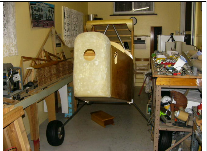
Photo on the right is of the Himax fuselage being built by your editor Malcolm McKenzie. The spring steel undercarriage and the fiberglass nose bowl have been fitted after the relevant brackets have been made. Tail feathers and wing ribs are stacked on the bench against the wall.